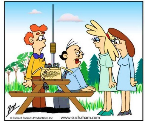
We thought YOU were bringing the food.